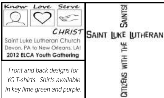
Front and back designs for YG T-shirts. Shirts available in key lime green and purple.

T-shirts for our group to wear while at the ELCA Youth Gathering in New Orleans. Group members will be wearing the shirts at the Cinco de Mayo event. We will also be taking orders for additional shirts, available in key